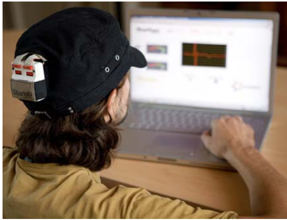
Fig. 1: ENOBIO sensor embedded in a cap. We can see the 4 channel inputs (red pins). In the picture, only two channels are plugged. The data are transmitted wirelessly to the laptop.

easy to place. Even though ENOBIO can work in dry mode, in this study conductive gel has been used (see fig. 1).